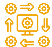
Oracle Primavera, Oracle Unifier, Asset Management