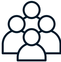
SOC Engineering & Support